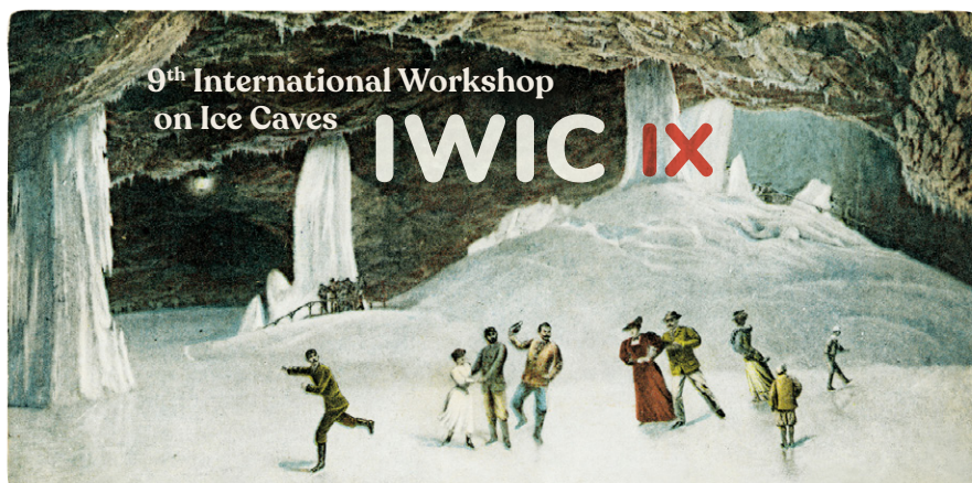
Dobšiná Ice Cave 1870 - 2020

State Nature Conservancy of the Slovak Republic, Slovak Caves Administration, Liptovský Mikuláš UIS Commission on Glacier, Firn and Ice Caves Slovak Museum of Nature Protection and Speleology, Liptovský Mikuláš Aggtelek National Park, Jósvalfő, Hungary Slovak Speleological Society